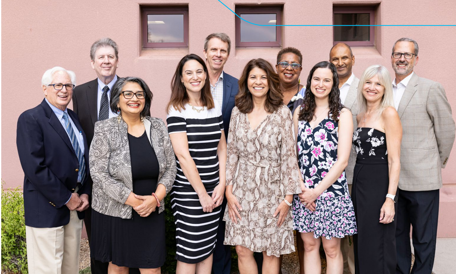
GME Leadership Team